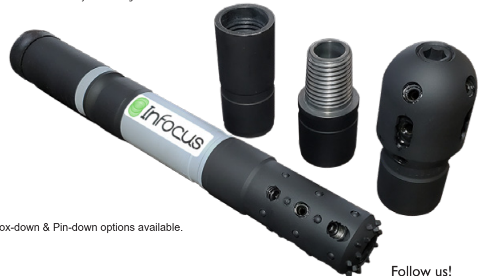
Box-down & Pin-down options available.

Operational specifications are for reference only. Actual tool performance may vary depending on a variety of downhole conditions. Performance data is subject to change without notice.