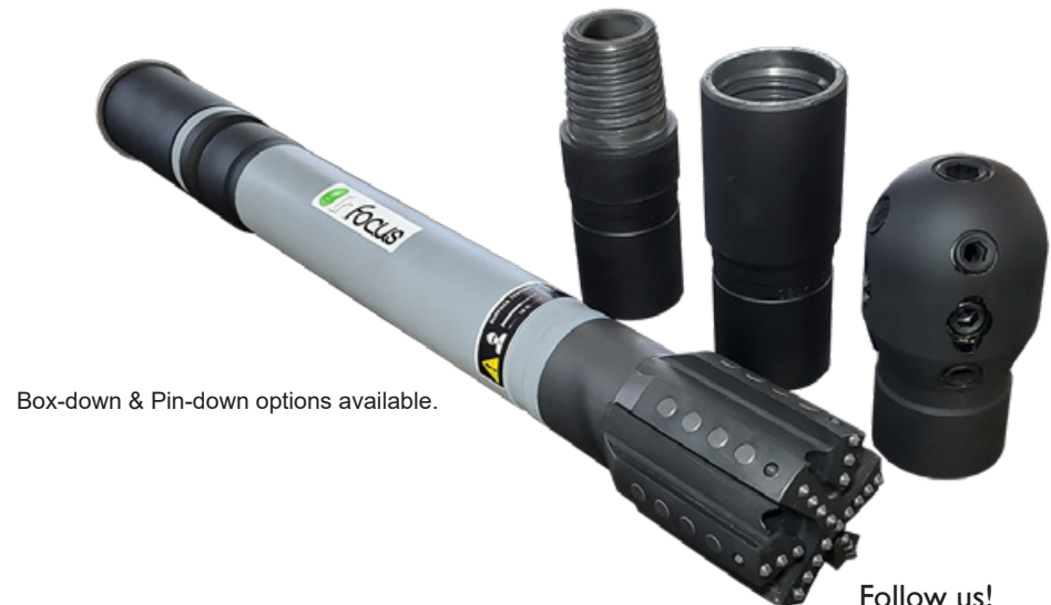
Box-down & Pin-down options available.