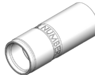
Box Down Crossover Sleeve 1.500 API REG