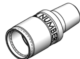
Pin Down Crossover Sleeve 1.500 API REG