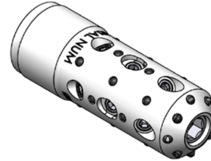
Milling Style Wash Nose Assembly Size: Ø2.060